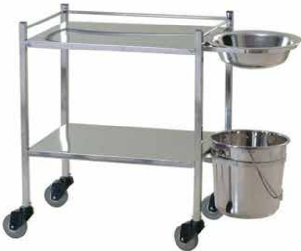
Ortho Service Trolley