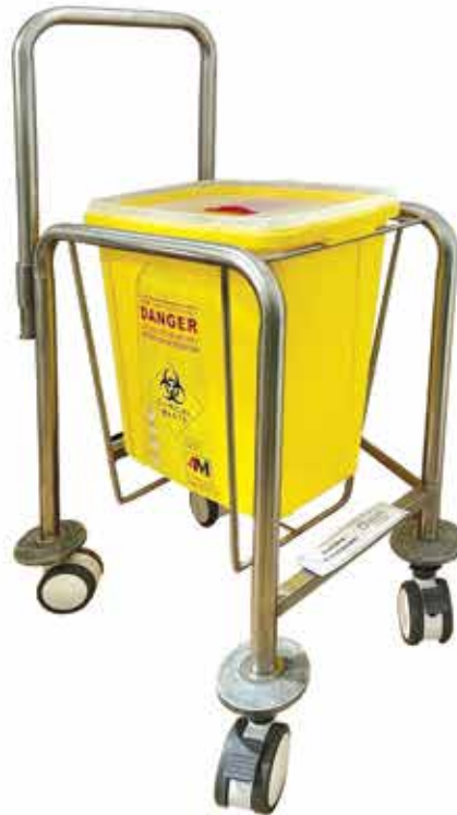
Sharp Container Trolley