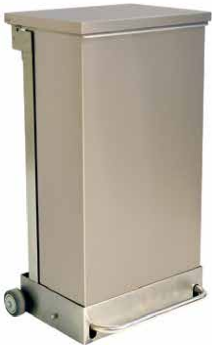
Stainless Steel Dustbin 60 ltr