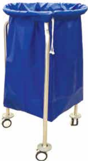
Dirty Linen Trolley Single Bag Round