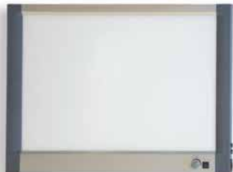
X-ray film viewer Double Slim