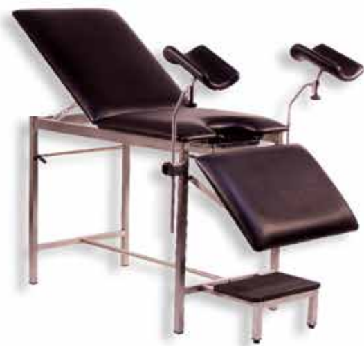
Gynecology Examination Couch