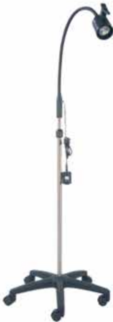
Examination Light LED