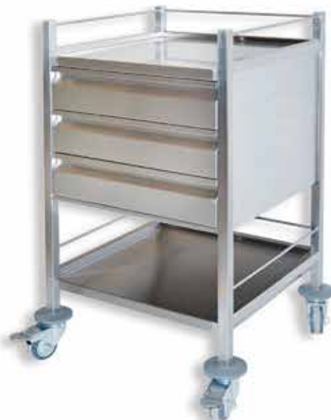
Dressing Trolley with 3 Drawers