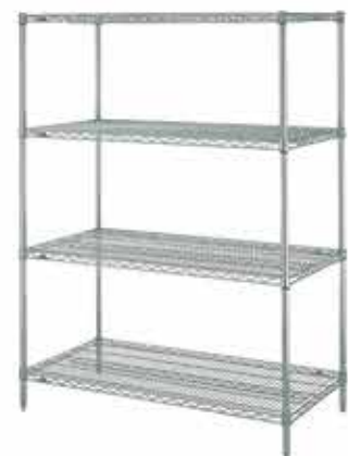
Wire Shelving Adjustable