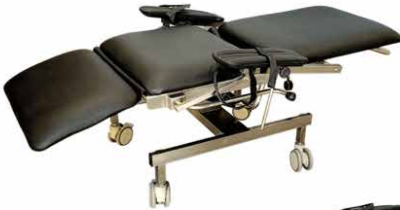
Blood Donor Chair