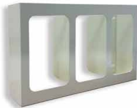
Powder coated Gloves Dispenser