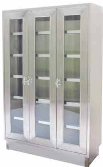
Upright Cabinet 3 Hinged Glass Doors