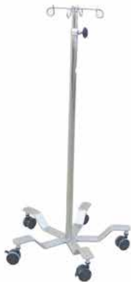
Heavy Duty Spider Leg Base Infusion Stand PMED - IVSL