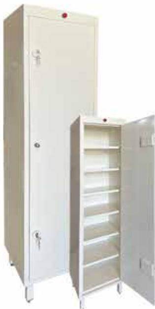
Upright Narcotic Cabinet with Single Door & Locks (Powder Coated)