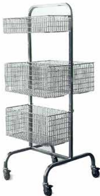
Sterile Basket Trolley