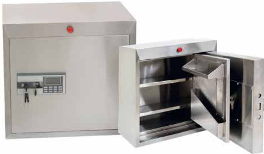
Narcotic Cabinet with Number Lock