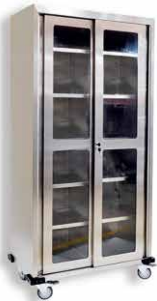
Upright Cabinet with 2 Sliding Glass door