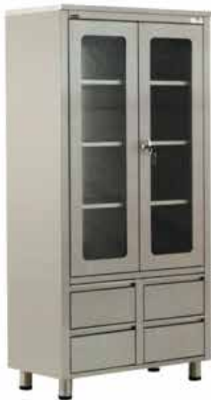
Upright Cabinet 2 Hinged Glass Doors with 4 Drawers