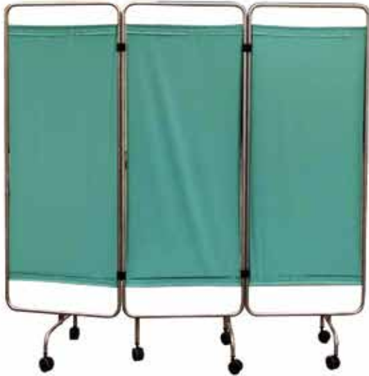
3 Fold Ward Screen