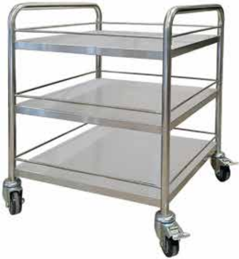
Instrument Trolley with 3 Shelf