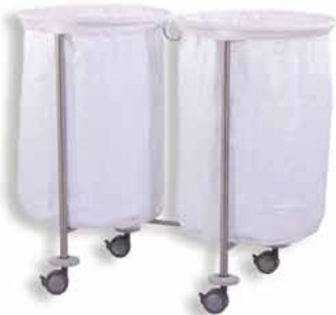
Dirty Linen Trolley Double Bag Round