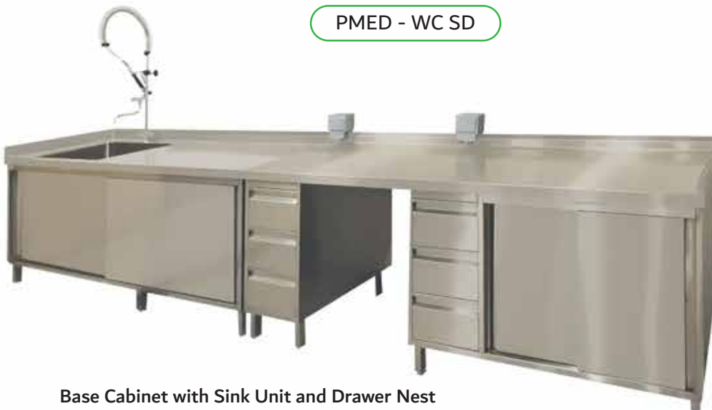
Base Cabinet with Sink Unit and Drawer Nest