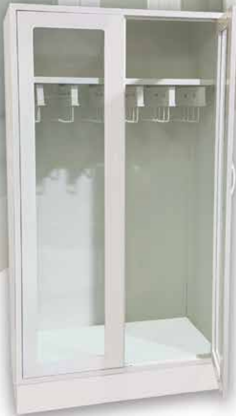
Catheter Cabinet with 6 Rails