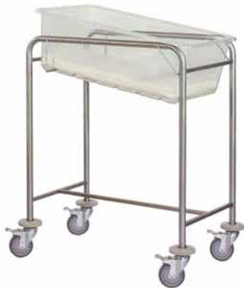
Baby Bassinet Trolley