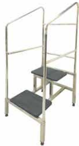
Double Step Foot Stool with Two Side Rail