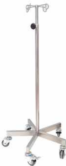
Heavy Duty Infusion Stand PMED - IVHD