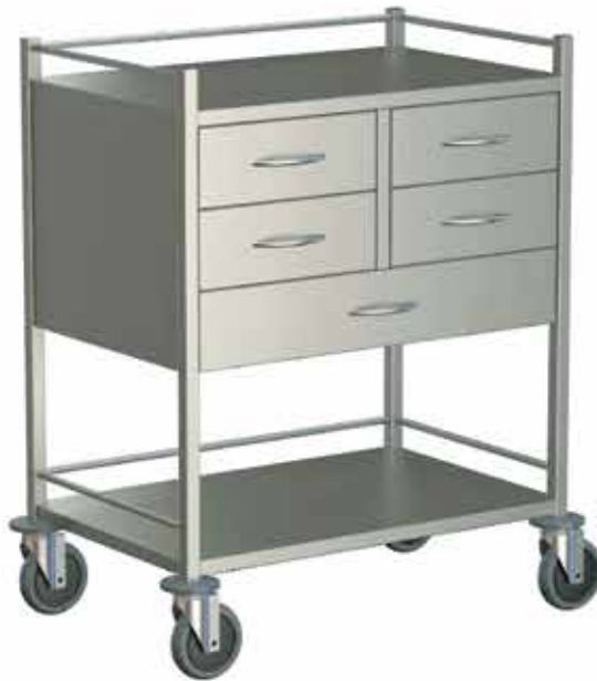
Instrument Trolley 5 Drawer