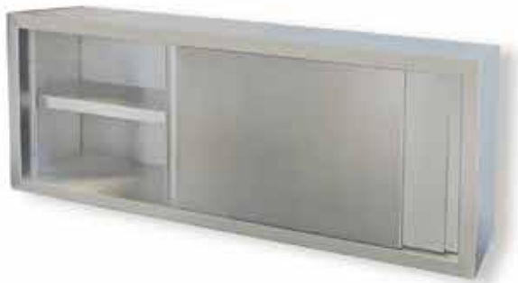
Wall Cabinet with Sliding Door