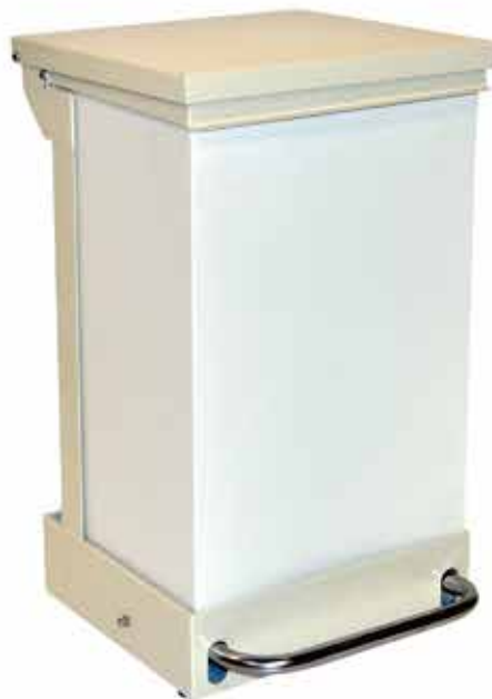
Powder Coated Dustbin 60 ltr