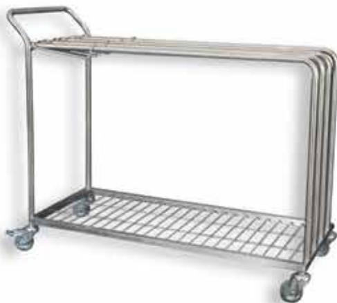
Paper Dispensing Cart on wheel