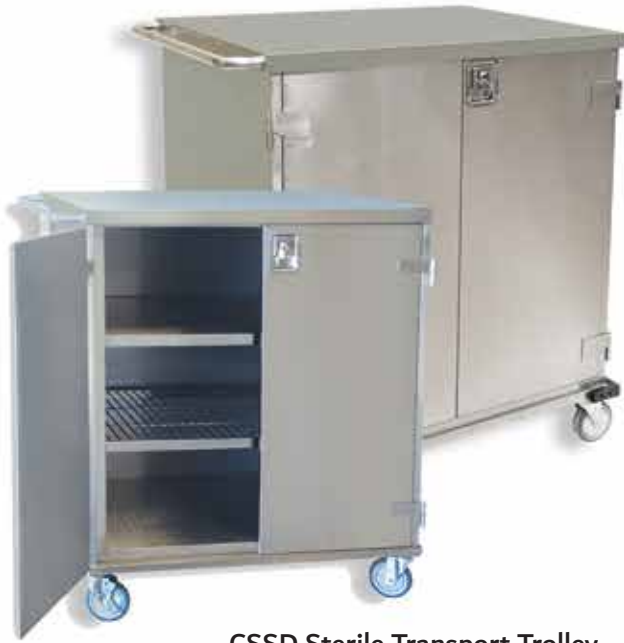
CSSD Sterile Transport Trolley