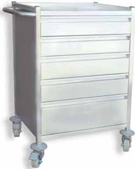
Procedure Trolley 5 Drawer