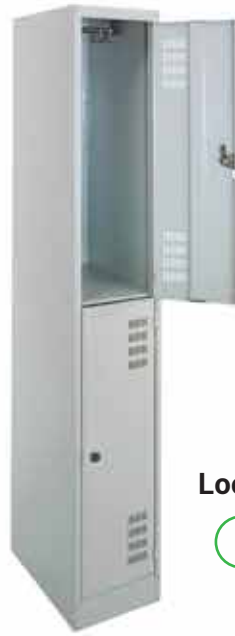
Locker with Two Door