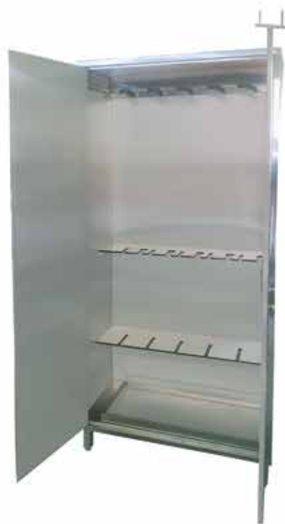
Endoscopic Cabinet with Glass Door