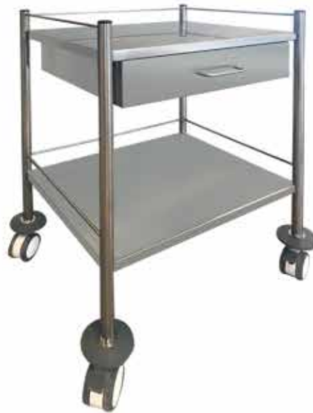
Instrument Trolley with Drawer