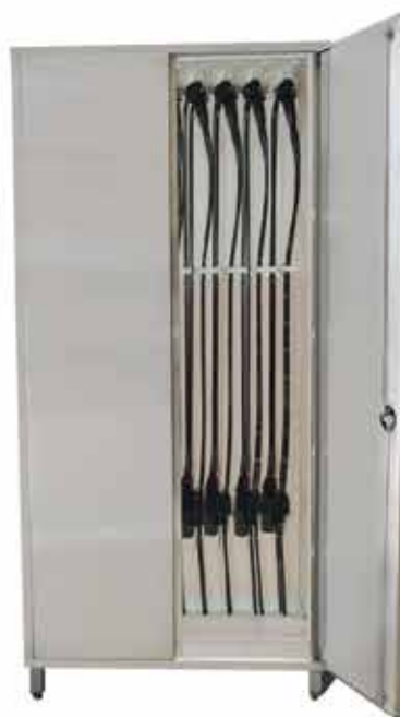
Endoscopic Cabinet with Solid Door