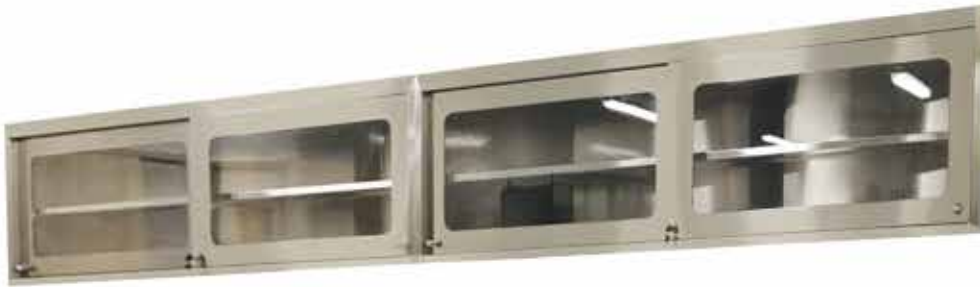
Wall Cabinet with Sliding Glass Doors