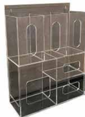
Acrylic PPE Holder