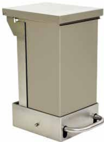
Stainless Steel Dustbin 20 ltr