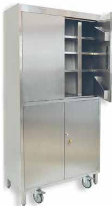
Upright Cabinet 4 Hinged Doors