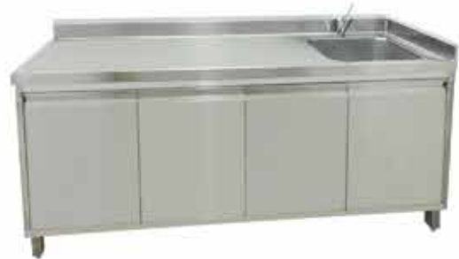
Sink Cabinet with Hinged Doors