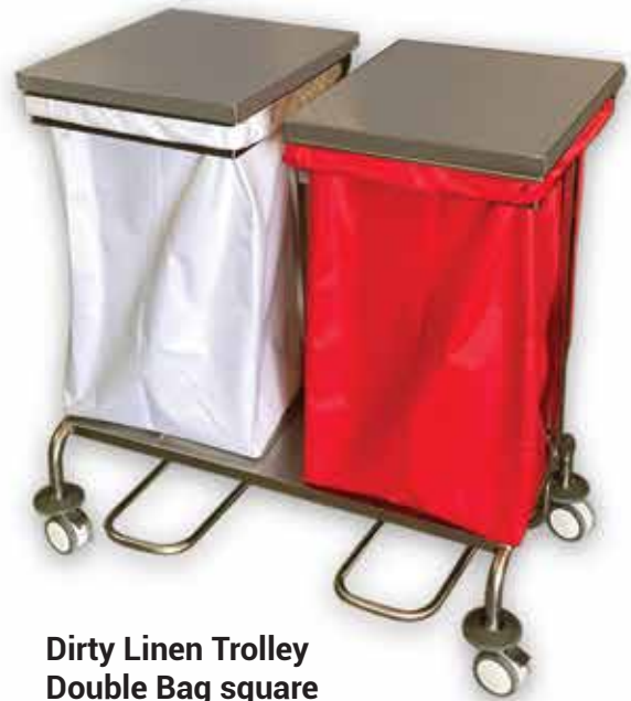
Dirty Linen Trolley Double Bag square