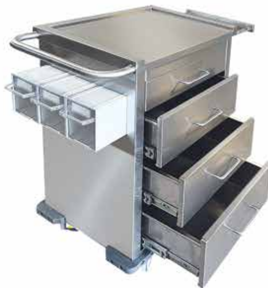
Procedure Cart with 4 Drawers & 3 Tilt Bin