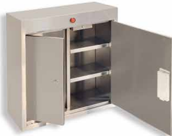
Narcotic Cabinet with Full Inner Door