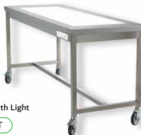
Inspection Table with Light