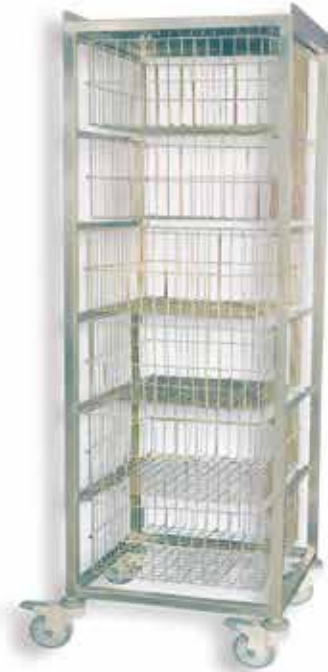
Sterile Transport Trolley