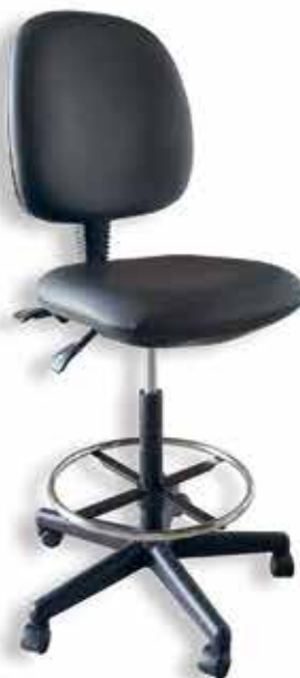
Revolving Stool - Low Backrest