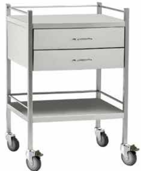
Instrument Trolley 2 Drawer