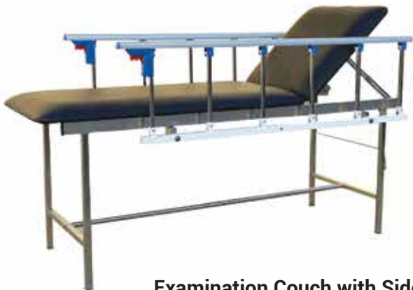
Examination Couch with Side Rails