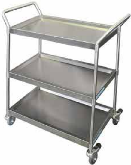
Instrument Trolley with 3 Shelf