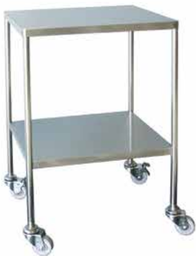
Back Trolley -S PMED - BT-S