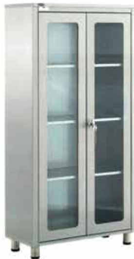
Upright Cabinet 2 Hinged Glass Doors