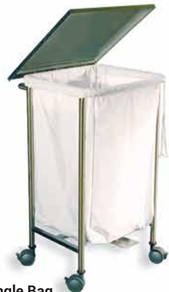
Dirty Linen Trolley Single Bag Square with Lid"