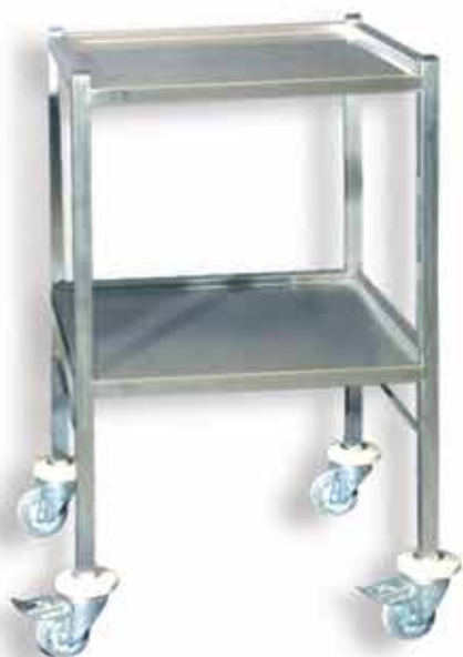
Dressing Trolley PMED - DT