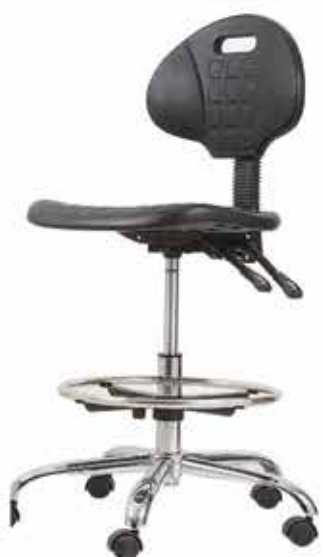
Revolving Stool with High Backrest