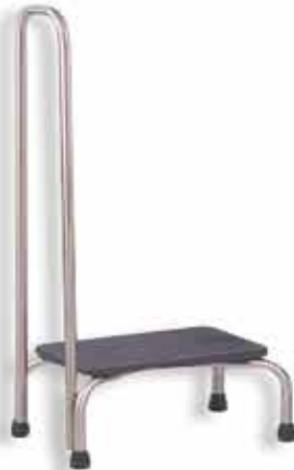
Single Step Foot Stool with One Side Hand Rail