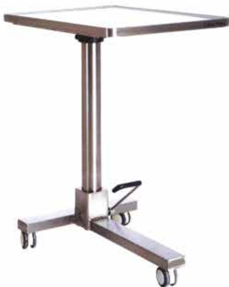
Hydraulic Mayo Trolley