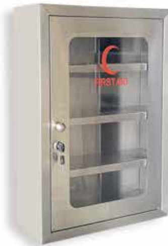
First Aid Box