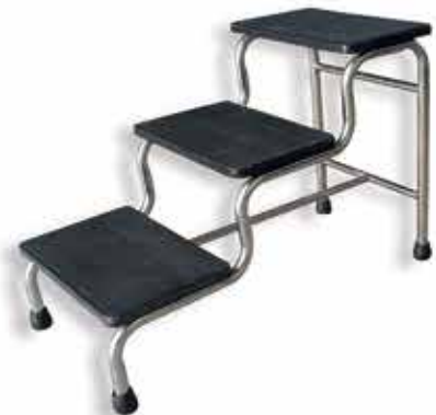
Triple Step Foot Stool