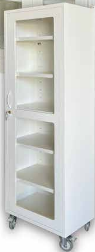
Upright Cabinet 1 Hinged Glass door with Powder coated