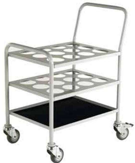
Cylinder Transport Trolley