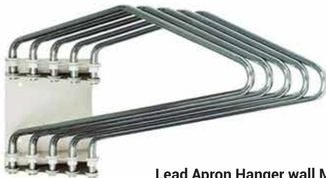
Lead Apron Hanger wall Mounted