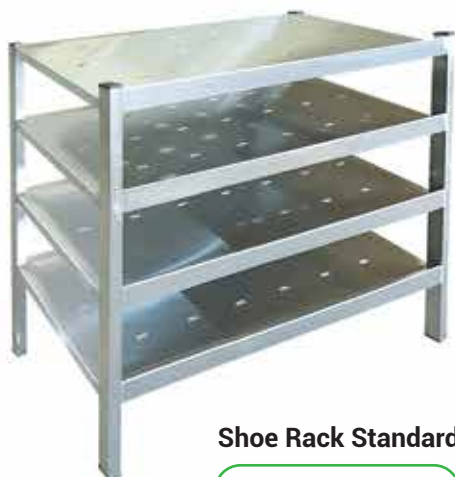
Shoe Rack Standard