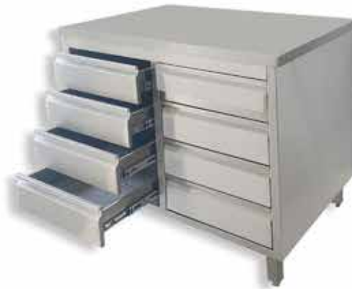
Base Cabinet with 8 Drawers