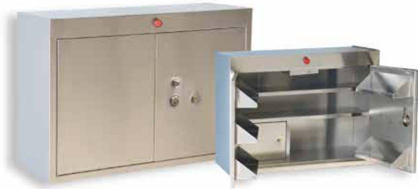
Narcotic Cabinet with Double Door