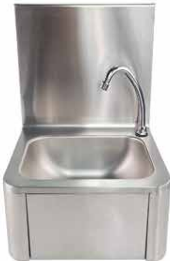
Hand Wash Sink- Knee Operated