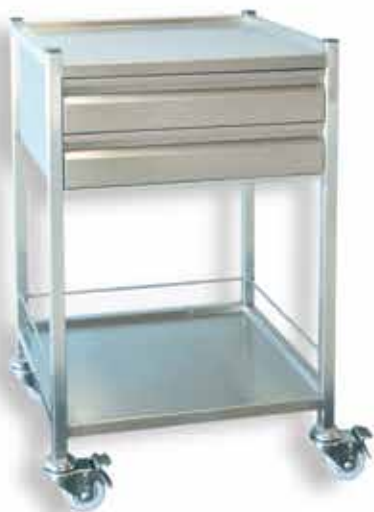
Dressing Trolley with Two drawers PMED - DT2