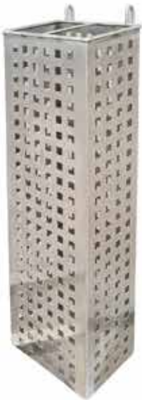
Catheter Basket -Long