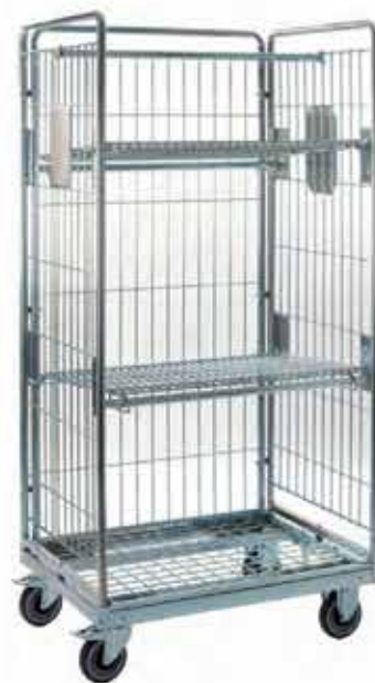
Loading Trolley with Wire Bottom