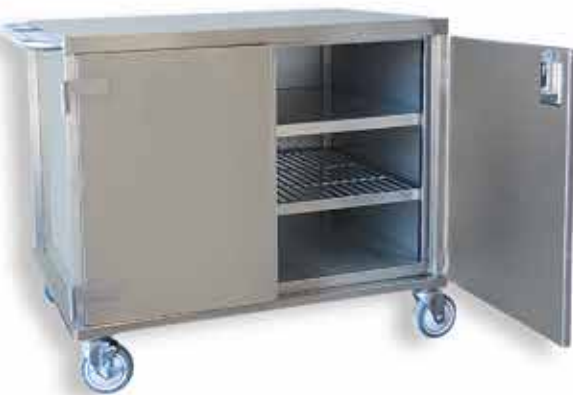
CSSD Sterile Transport Trolley