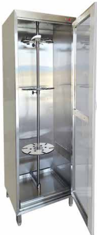
Endoscopic Cabinet with Rotating Holder