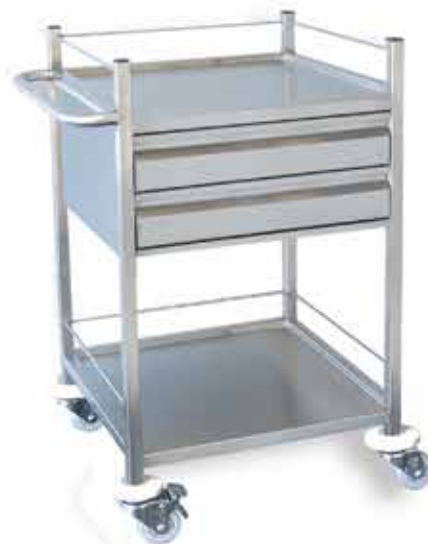
Deressing Trolley 2 Drawers