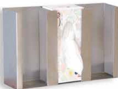
Stainless Steel Gloves Dispenser