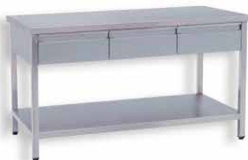
Work Table with 3 Drawer