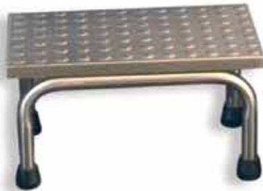
Single Step Foot Stool- Stainless Steel