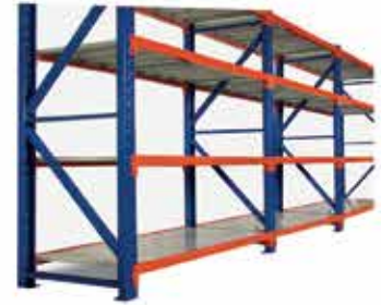
Heavy Duty Rack Shelving