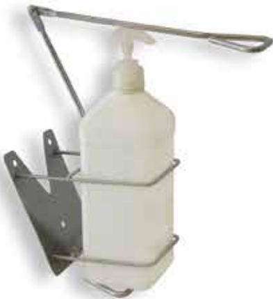
Soap Dispenser Elbow Operated