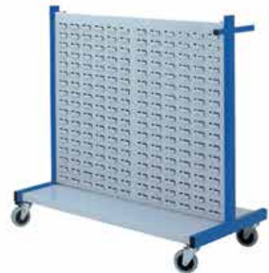
Lin Bin Holder on Wheel