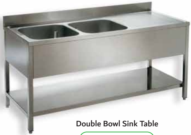
Double Bowl Sink Table