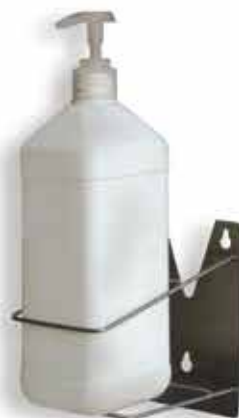
Soap Dispenser- Normal