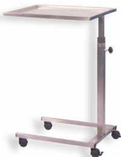
Mayo Trolley 4 wheel