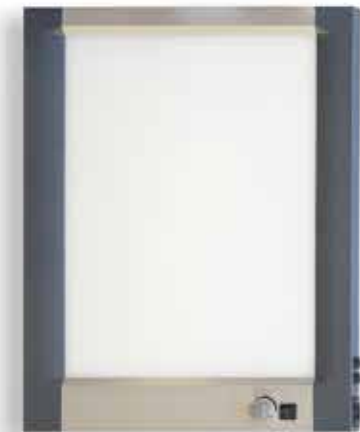
X-ray film viewer Single Slim