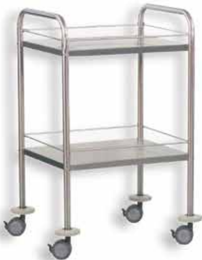
Instrument Trolley with Rails