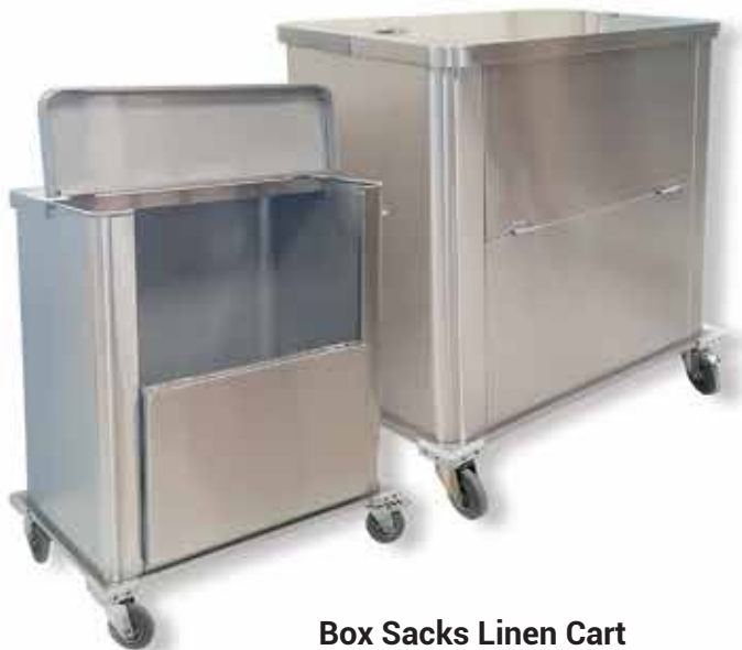
Box Sacks Linen Cart