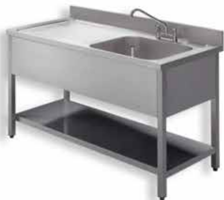
Single Bowl Sink with Undershelf