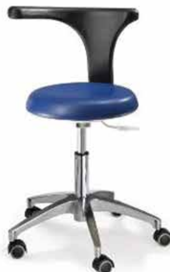
Revolving Stool with Side Rest