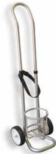
Cylinder Transport Trolley