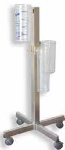
Mobile Suction Trolley PMED - IVST