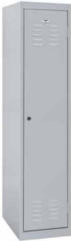
Locker with Single Door