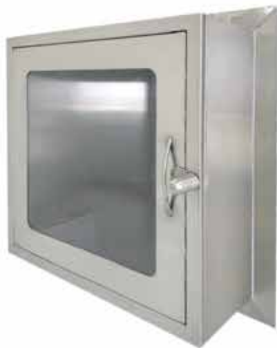
Pass through Chamber Hinged Door