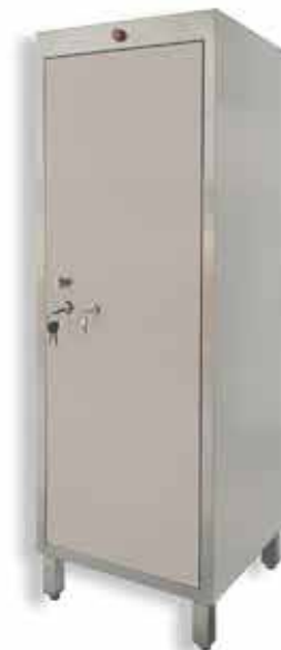
Upright Narcotic Cabinet with Single Door