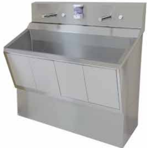
Double Station Scrub Sink