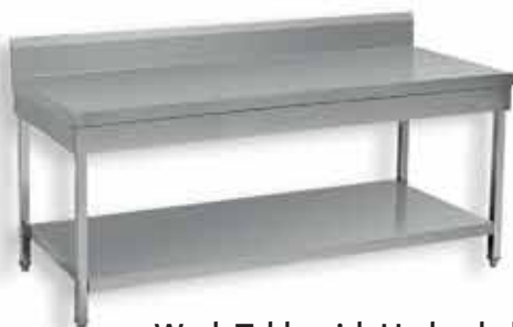
Work Table with Undershaft