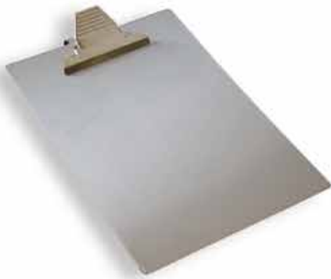
Patient Chart Holder- Stainless Steel