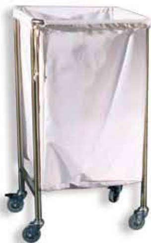
Dirty Linen Trolley Single Bag square