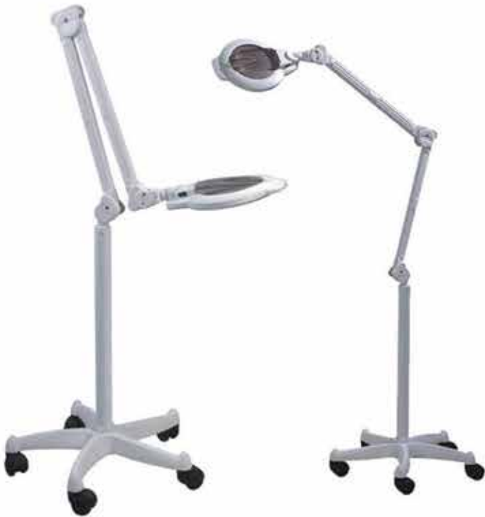
Magnifying Lamp on Wheel