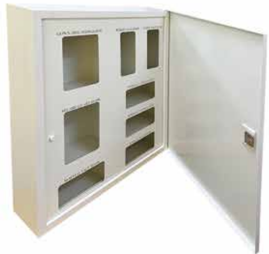
PPE Holder Powder Coated with Door