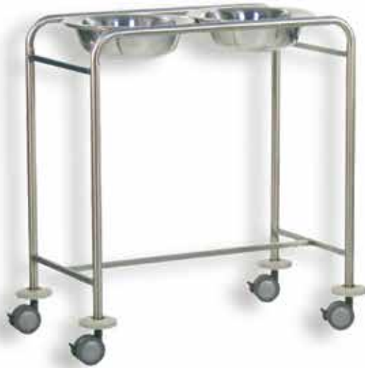
Double Wash Basin Trolley