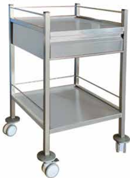
Dressing Trolley with 1 Drawer