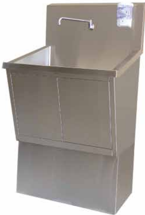
Single Station Scrub Sink