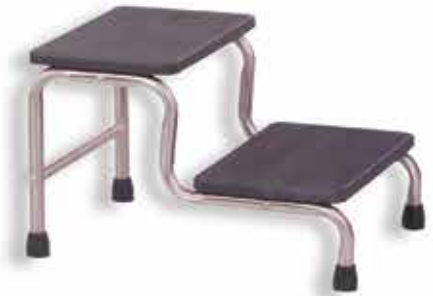
Double Step Footstool