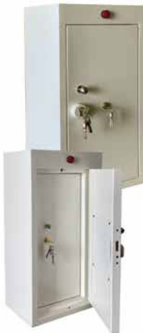
Narcotic Cabinet with Full Inner Door - Powder Coated