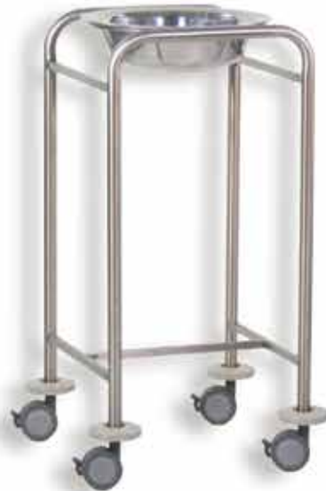
Single Wash Basin Trolley