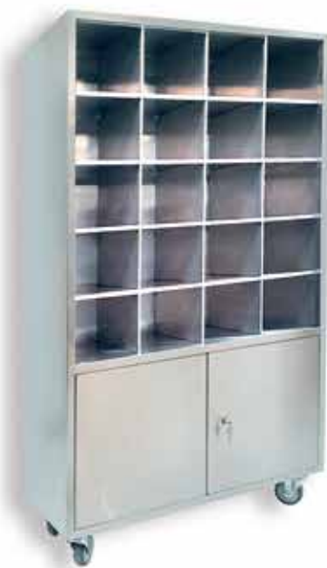
Upright Cabinet 20 Pegion Holes