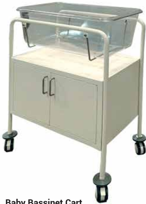
Baby Bassinet Cart