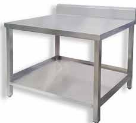
Work Table with Undershaft