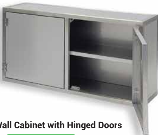
Wall Cabinet with Hinged Doors