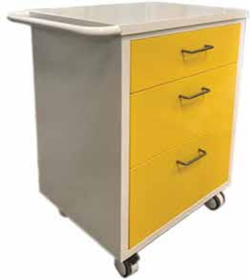
Medication Cart Powder Coated