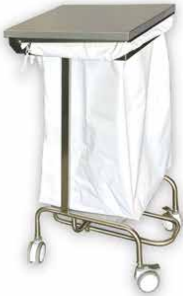
Linen Skip with Lid