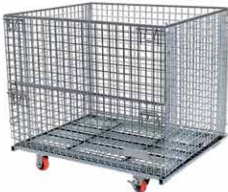
Wire Mesh Trolley