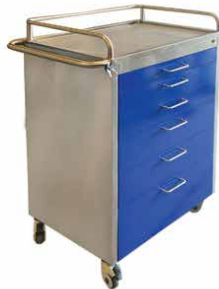
Medication Cart Stainless Steel