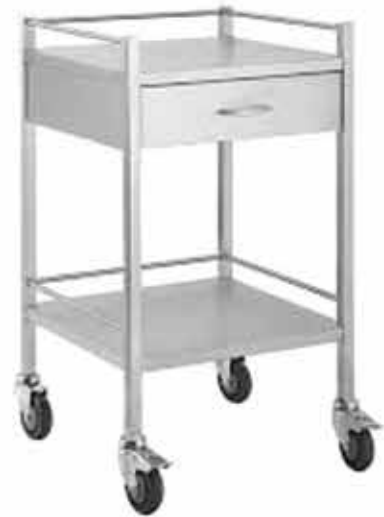
Instrument Trolley 1 Drawer