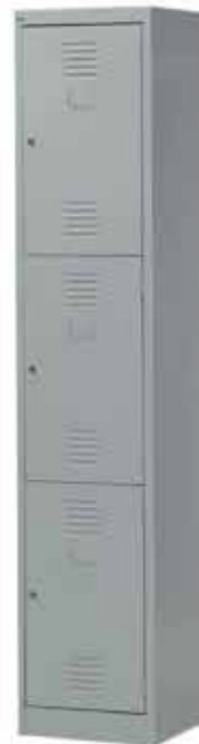
Locker with Three Door