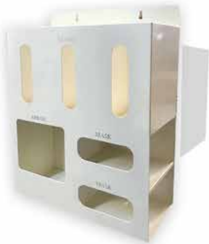
PPE Holder Powder Coated