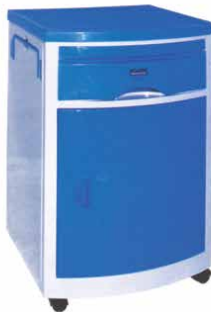
Bed Side Cabinet