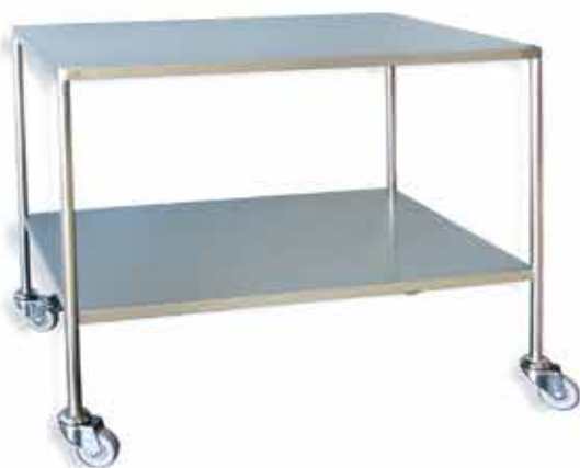
Back Trolley-M PMED - BT-M