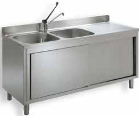
Double Bowl Sink Cabinet with Sliding Doors