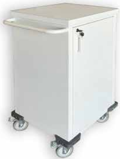
Powder Coated Transport Trolley