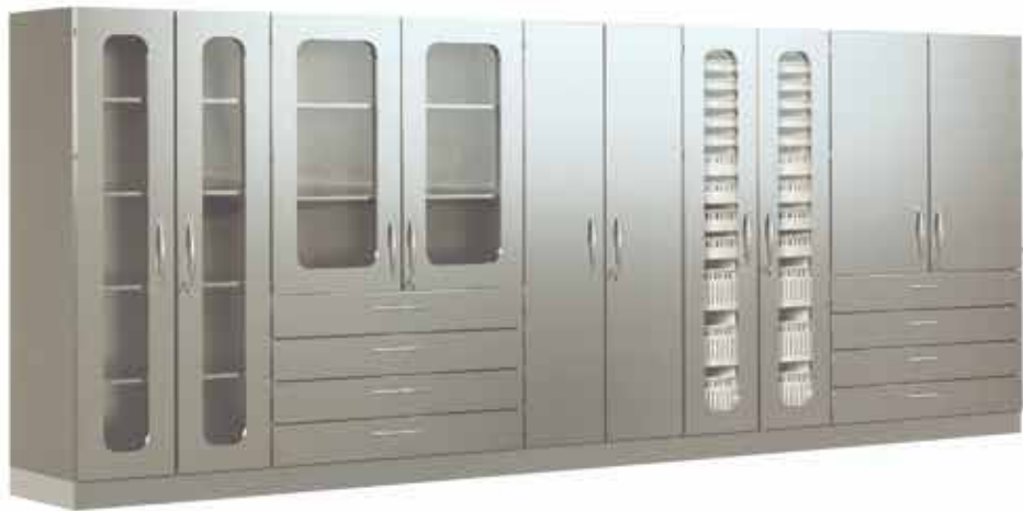
Operation Theatre Unit