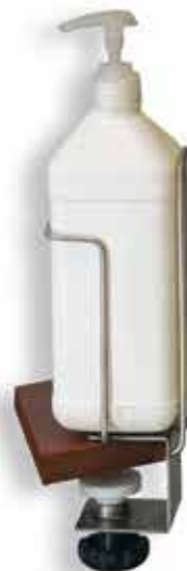
Soap Dispenser Table Mounted