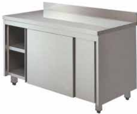
Base Cabinet with Sliding Doors