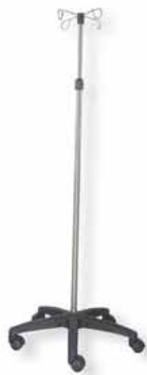
Infusion Stand with Nylon Base PMED - IVN