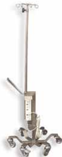
Syringe Pump Stand PMED - IVSP