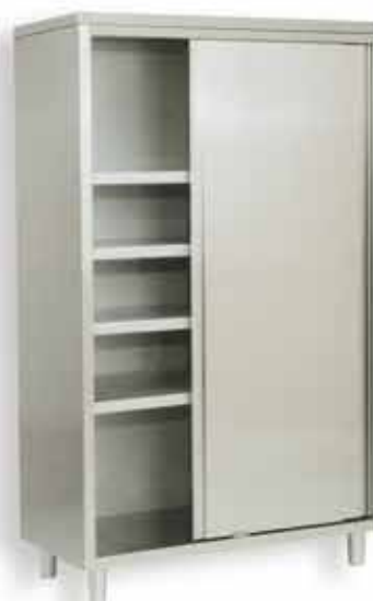
Upright Cabinet 2 Solid Sliding Doors.