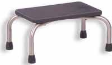
Single Step Footstool