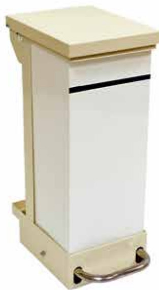
Powder Coated Dustbin 20 ltr