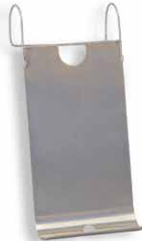
Urine Bag Holder