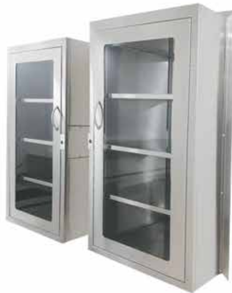
Pass through Window Hinged Door - Touchless Sensor