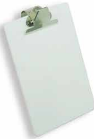
Patient Chart Holder -Plastic