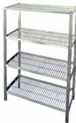
Wire Shelving Fixed