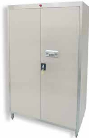
Upright Narcotic Cabinet with Double Doors and Electronic Number Lock