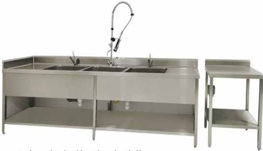
Tripple Bowl Sink Table with Under Shelf