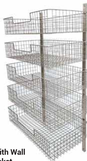
Wire Basket with Wall Mounting Bracket