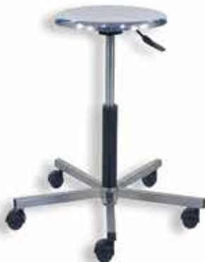
Revolving Stool SS Seat