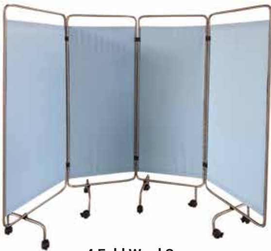
4 Fold Ward Screen