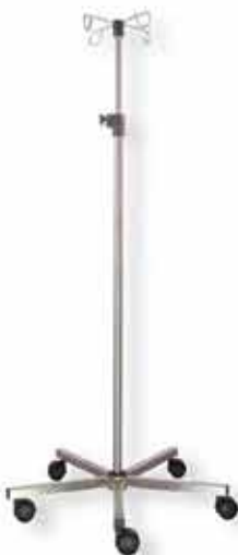
Infusion Stand with Stainless Steel Base PMED - IVSS