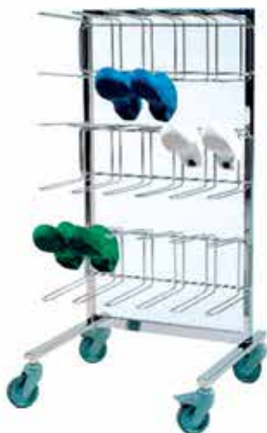
Shoe Rack on Wheel