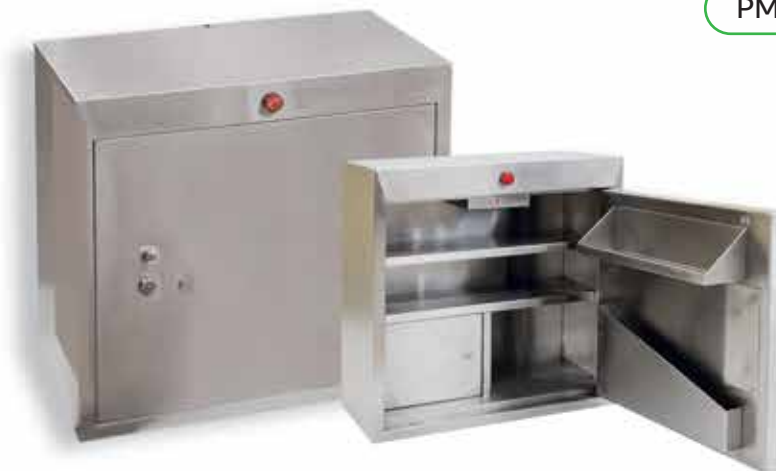
Narcotic Cabinet with Single Door