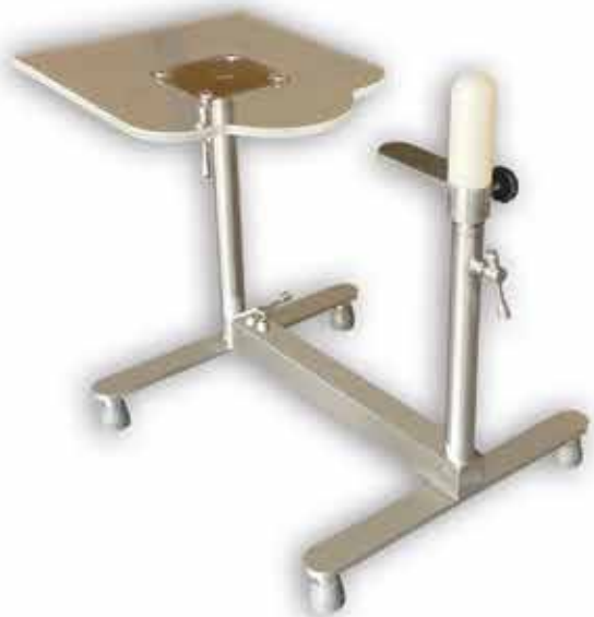
Spica Cast Table